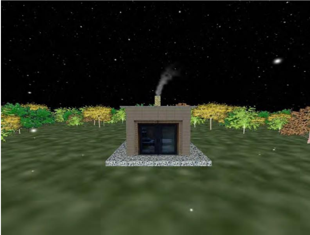
Figure 3. The snow, and the smoke out of the chimney