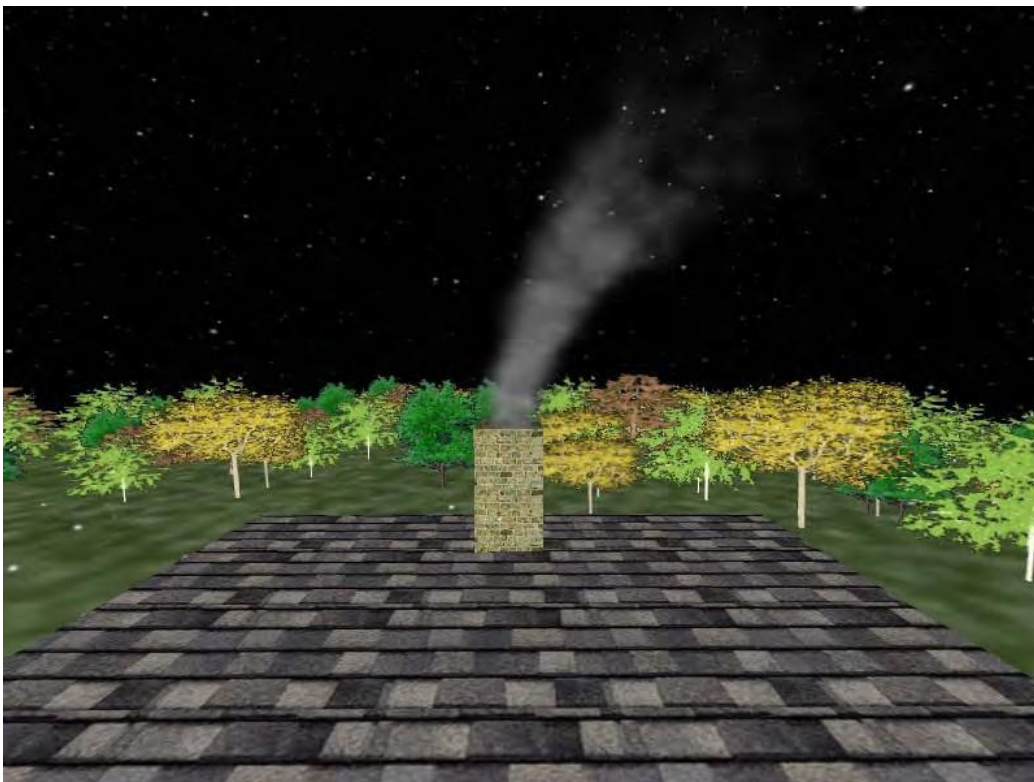
Figure 4. A closer look at the smoke