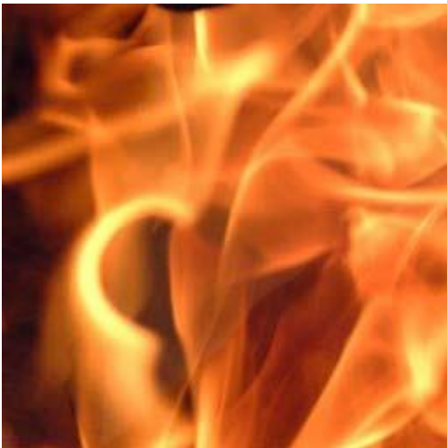
Figure 2. Texture for Fire Flame