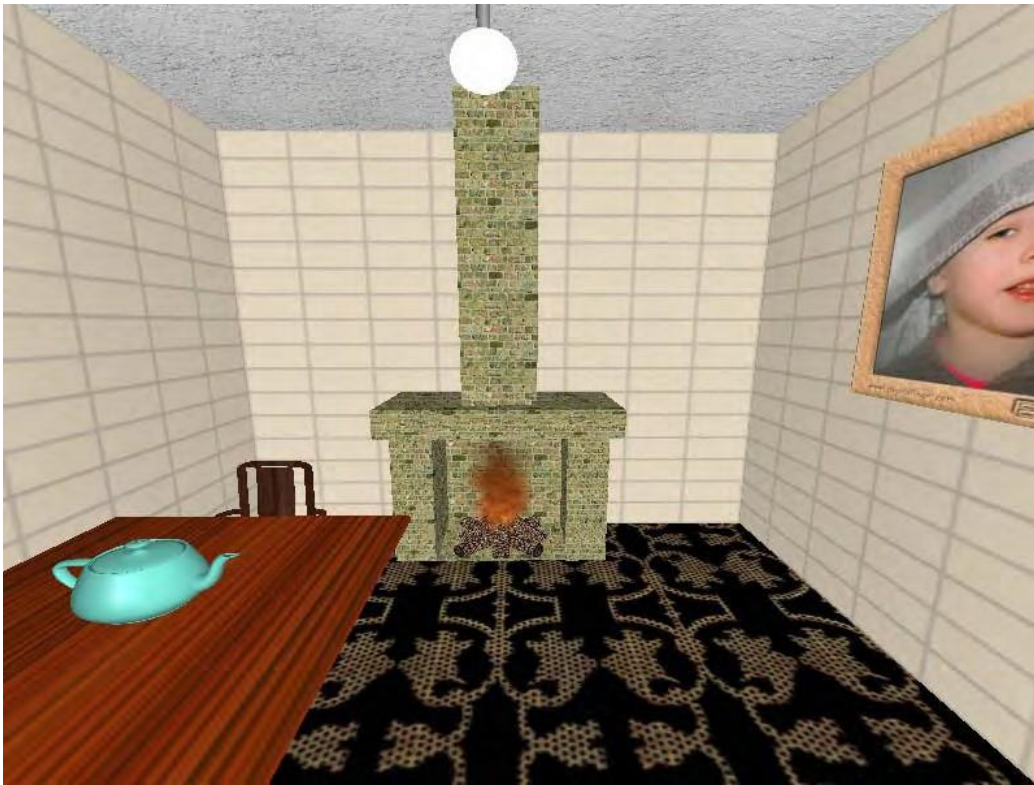
Figure 5. The fire in the fireplace